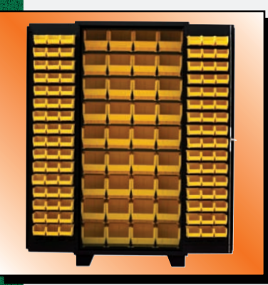
Model DZ236 Shown