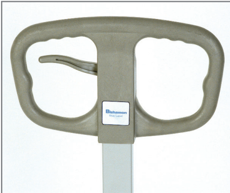
Three position ergonomic hand lever controls the hydraulic system with the handle in any position