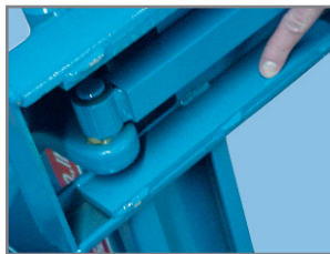
Steel reinforced plate strengthens frame and keeps forks parallel