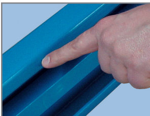
Formed fork for added strength and durability