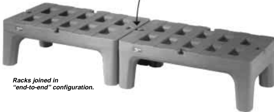
Racks joined in “end-to-end” configuration.