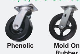
Phenolic Mold On Rubber