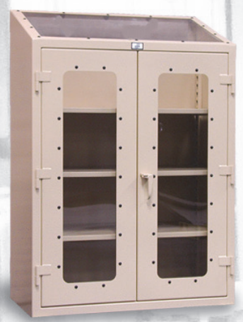
MODEL NUMBER: 45-LD-243-NL-SL-SRP