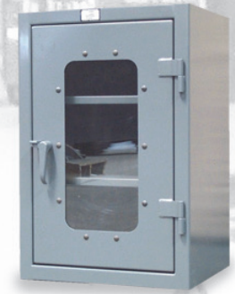
MODEL NUMBER: 43.5-LD-242