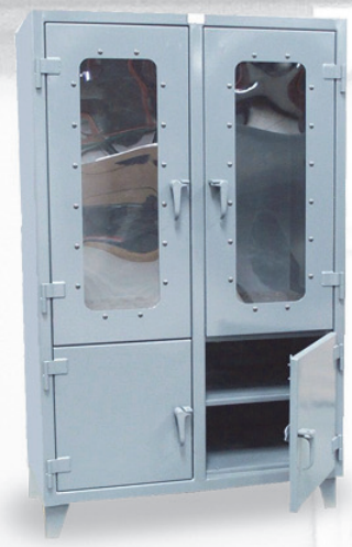
MODEL NUMBER: 66-4DLD-248