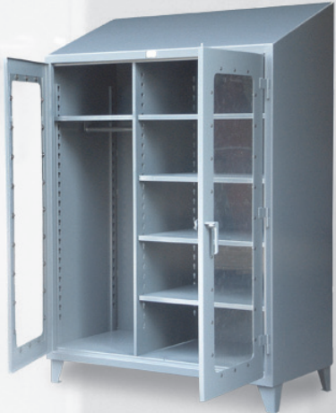
WARDROBE CABINET WITH SEE-THRU DOORS

MODEL NUMBER: 56-LDW-245-SL Dimensions: 60" w x 24" d x 72" h (87" OAH) 1 - Hanger shelf that will hold up to 675 lbs. 4 - Adjustable shelves that have a capacity of 975 lbs. each 3-point locking system with standard padlock provision