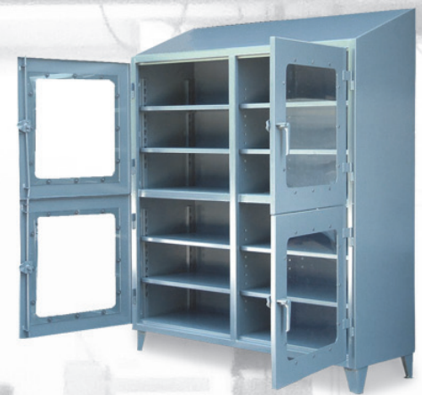
MODEL NUMBER: 66-4D-LD-248-SL-CFG