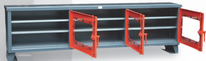
MODEL NUMBER: 92.2-3MS-LD-166-SKL