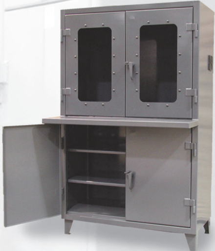
MULTIFACETED COMPUTER CABINET WITH SEE-THRU DOORS

MODEL NUMBER: 46-CC-LD-244-ES Dimensions: 48" w x 24" d x 72" h (78" OAH) Welded shelf measuring 12" deep for extended work space 2 - Individual locking compartments on top and bottom