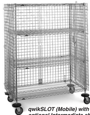
quwikSLOT (Mobile) with optional Intermediate shelves