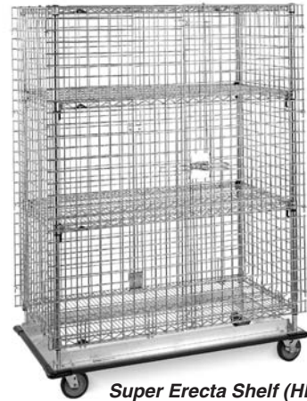
Super Erecta Shelf (HD Mobile) with optional Super Adjustable Super Erecta® Intermediate shelves