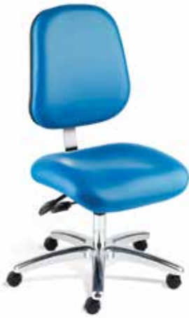
5-legged fully polished cast aluminum, 27" leg spread (26" caster to caster)