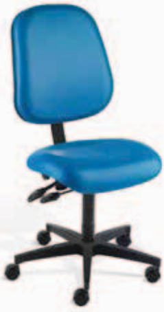
5-legged cast aluminum, 23" leg spread