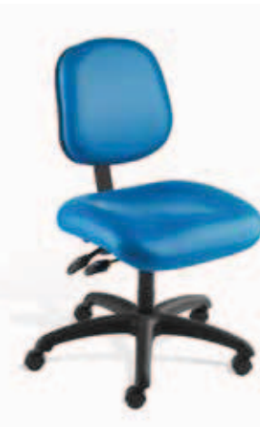
5-legged black reinforced composite, 27" leg spread (26" caster to caster)