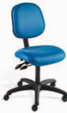
5-legged black reinforced composite, 27" leg spread (26" caster to caster)