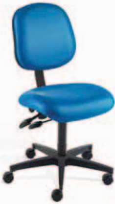
5-legged cast aluminum, 23" leg spread