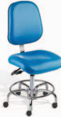
5-legged tubular steel with 20" diameter attached footring, 23" leg spread

Model shown has optional chrome metal parts