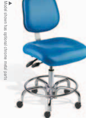
5-legged tubular steel with 20" diameter attached footring, 23" leg spread