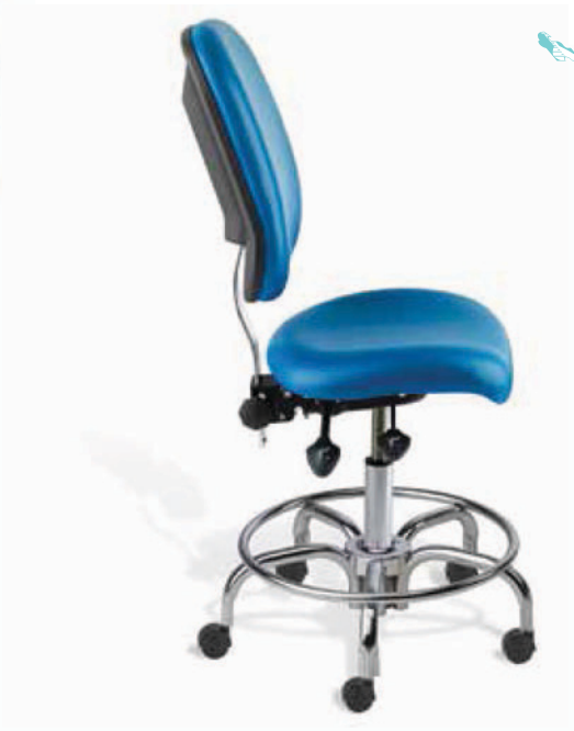
▲ HCT2128CRC-VF-C Model shown has optional chrome metal parts