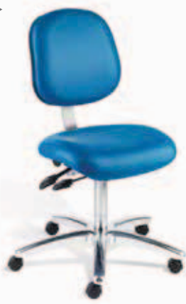
5-legged fully polished cast aluminum, 27" leg spread (26" caster to caster)

Model shown has optional chrome metal parts