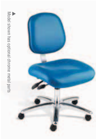
Model shown has optional chrome metal parts