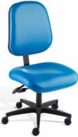
5-legged cast aluminum, 23" leg spread