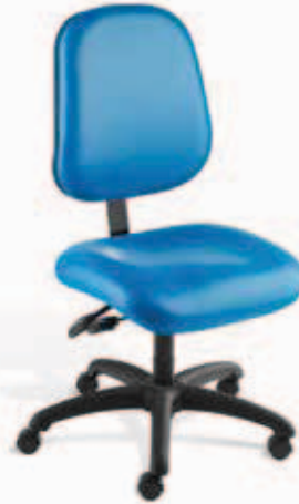
5-legged black reinforced composite, 27" leg spread (26" caster to caster)