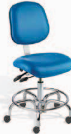
5-legged tubular steel with 20" diameter attached footing, 23" leg spread

Model shown has optional chrome metal parts