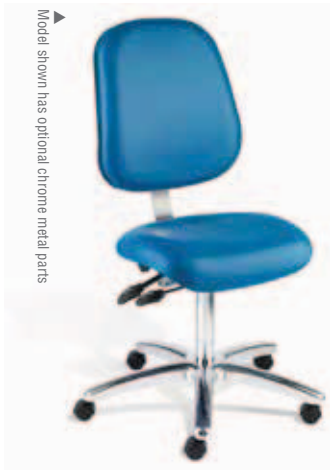
Model shown has optional chrome metal parts