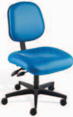
5-legged cast aluminum, 23" leg spread