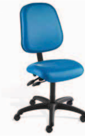
5-legged black reinforced composite, 27" leg spread (26" caster to caster)