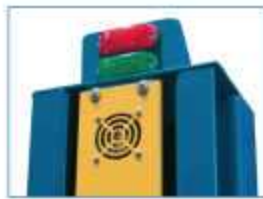
Mast lights (Red & Green) to indicate pallet presence and fault conditions