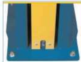
Pallet sensor to detect pallet presence before extending forks