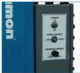
Operator console mounted to back of mast