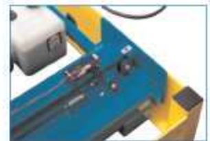
Linear motion structure with telescopic forks