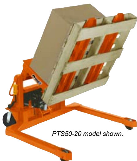
PTS50-20 model shown.

Distributed By: Custom Equipment Company 866-333-0728 919-847-5765 fax tom@custommhs.com www.custommhs.com