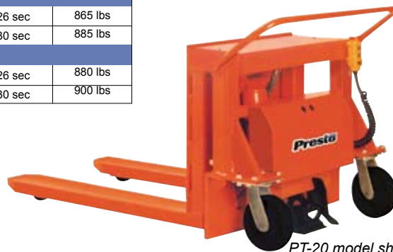
PT-20 model shown.