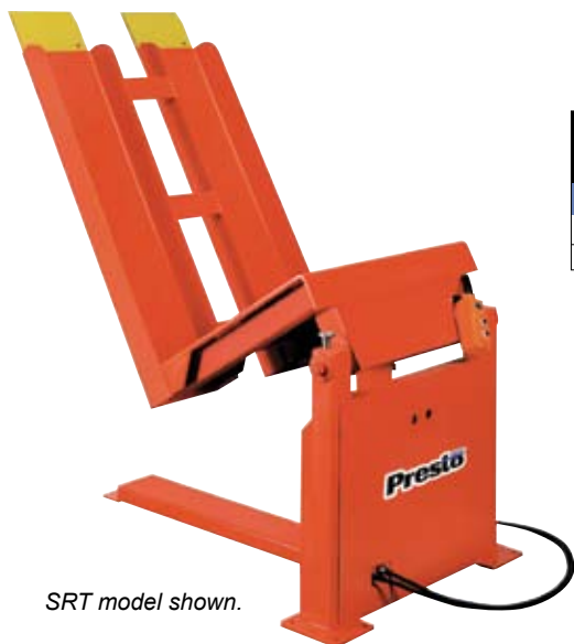
SRT model shown.