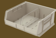
30250 with 40245CRY Clear Length Divider