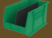
30260 with 40260 Length Divider