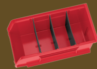
30230 with 41230 Width Dividers