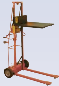
261160 Frame w/ 261163 Platform

A 5 Year Guarantee Against Weld Failure. A Wesco Quality Exclusive.