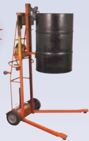
261160 Frame w/ 261161 Drum Lifter