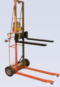
261160 Frame w/ 261162 Adjustable Forks