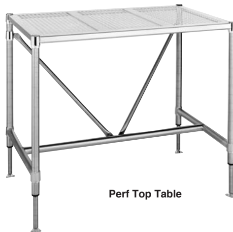
Perf Top Table