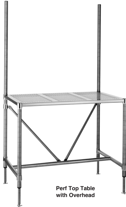
Perf Top Table with Overhead