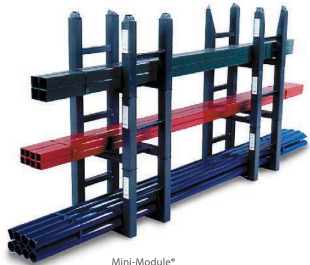
Mini-Module® 6 units shown