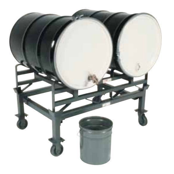
HD-555 (Rack not included)