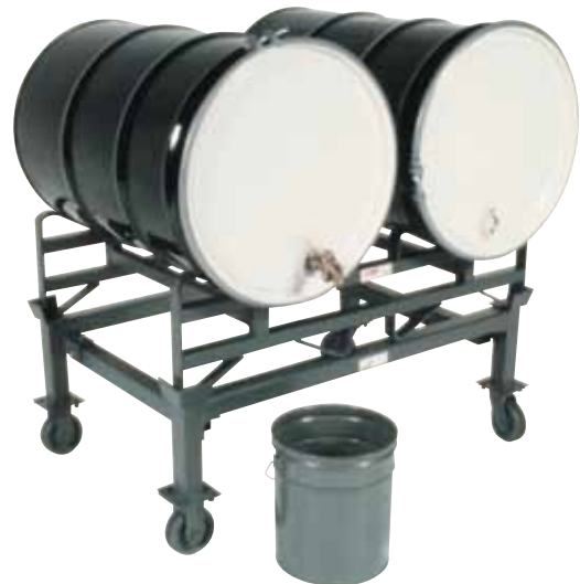
HD-555 (Rack not included)