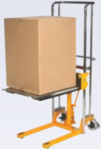
Chrome plated platform is an option.