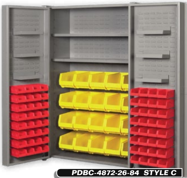
PDBC-4872-26-84 STYLE C