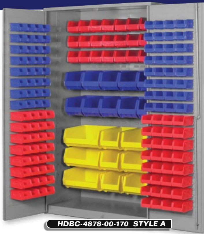
HDHC-4878-00-170 STYLE A