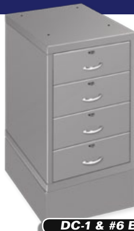
DC-1 & #6 Base