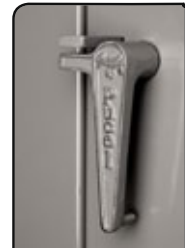
Durable Cast Handle