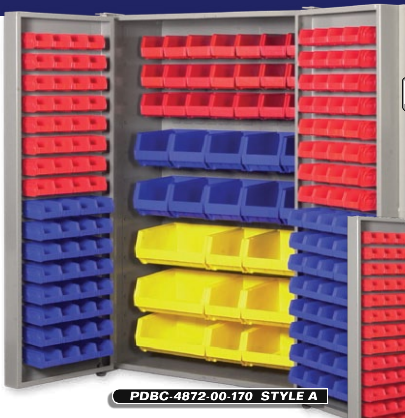
PDBC-4872-00-170 STYLE A