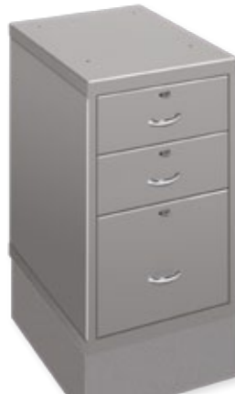
DCF-1 & #6 Base