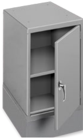
BC-1 & #6 Base