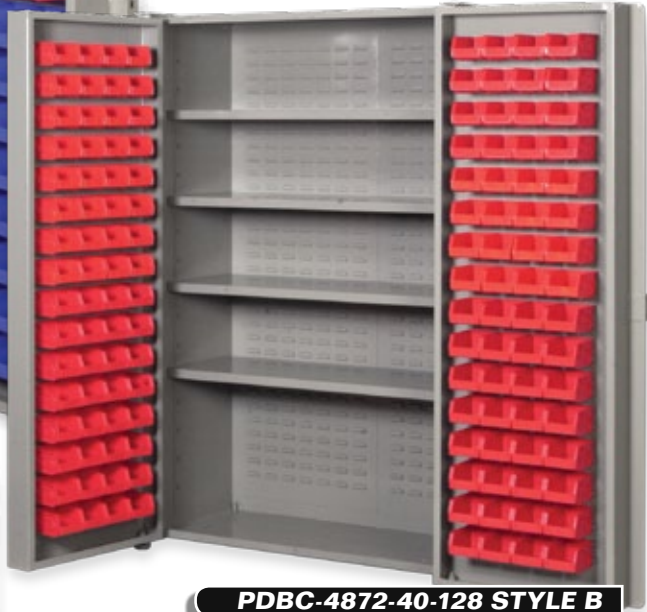
PDBC-4872-40-128 STYLE B