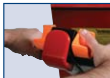
Easy fingertip controls.