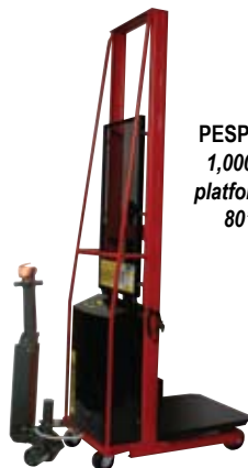
Model # PESPL-80-2424-PD 1,000 lb. capacity platform model with 80" lift height