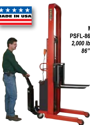
Model # PSFL-86-25-20S-2K-PD 2,000 lb. capacity and 86" lift height