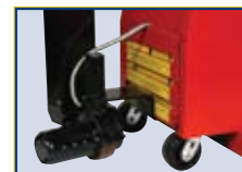
High torque motor drive.

Battery Powered System provides both propulsion and lift! Eliminates the stress and strain of lifting and transporting heavy loads. All Wesco power lift stackers can be ordered as power drive models (except for telescoping models). All other operating specifications are the same as equivalent power lift-only models. To order, simply add "-PD" to the end of the Model #. See charts on pages 62 & 63 for a complete listing.