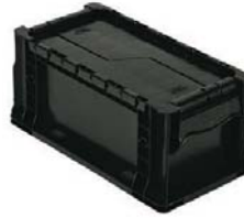
RSO1408-7 available in Black only and with an attached lid.

* Cannot be used on DLY-2415. Use with DLY-3018 Dolly.