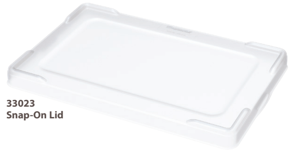
33023 Snap-On Lid