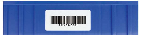
29203 Adhesive Label