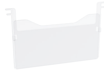
35011 Label Holder