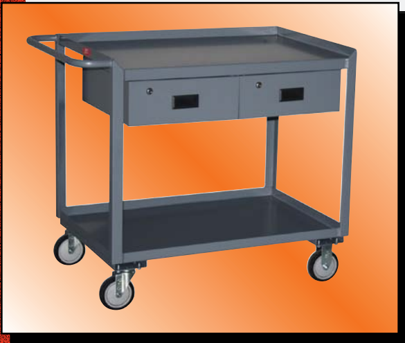
Model SR Shown

1,200 LB CAP.* (*800 lb. with T5 casters)