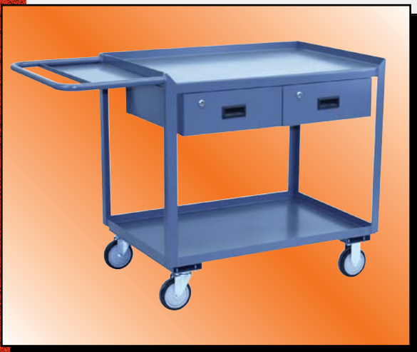
Model SV Shown

1,200 LB CAP.* (*800 lb. with T5 casters)