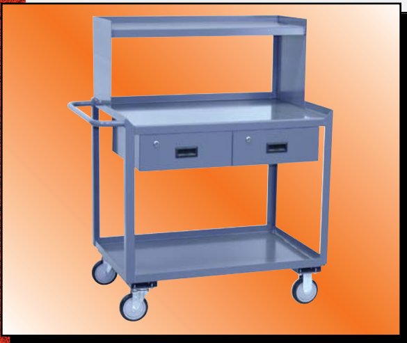
Model ST Shown

1,200 LB CAP.* (*800 lb. with T5 casters)