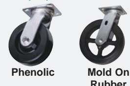
Phenolic Mold On Rubber