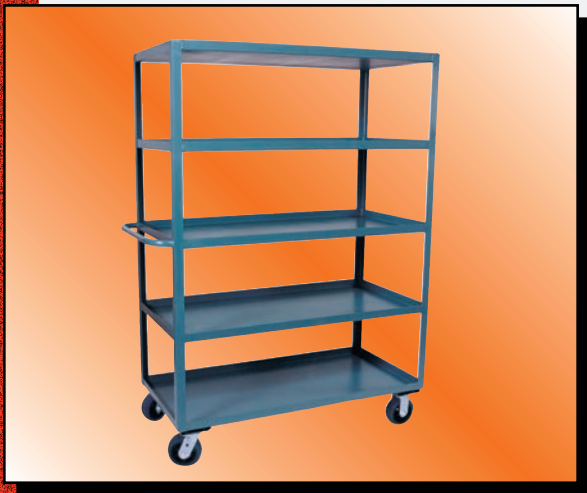
Model CE Shown