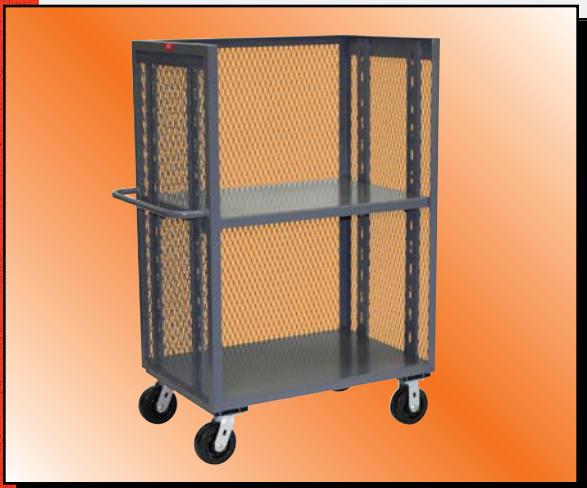
Model ZR Shown With Option FA