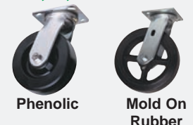
Phenolic Mold On Rubber