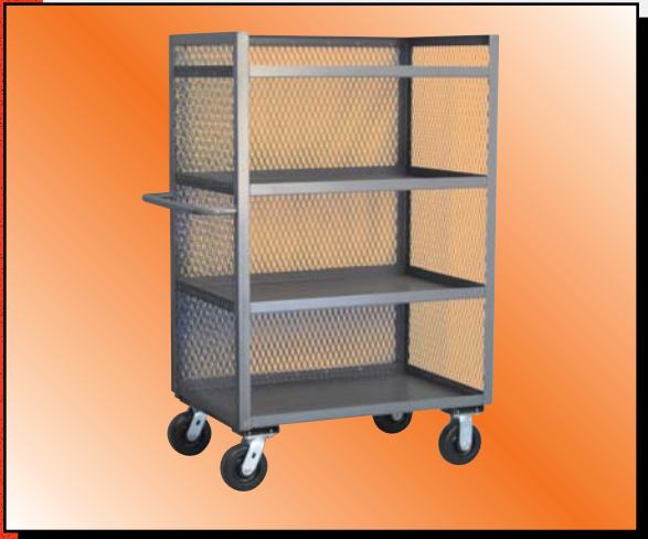
Model ZD Shown