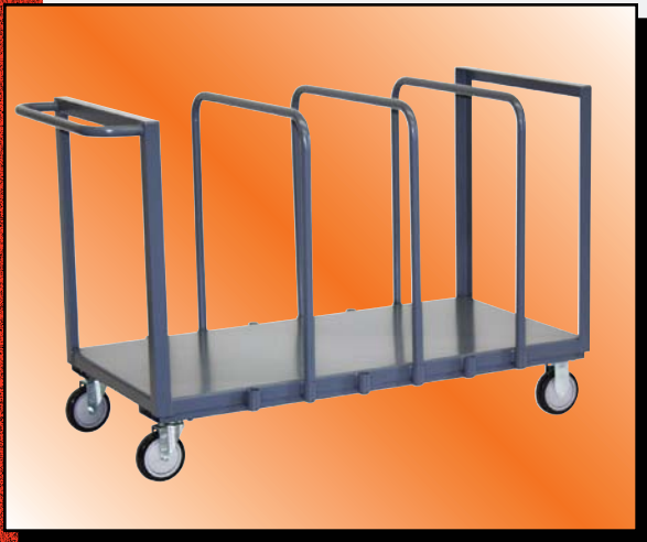
Model CS Shown

1,200 LB CAP.* (*800 lb. with T5 casters)