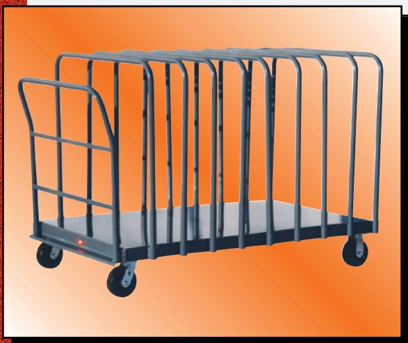
Model DG Shown

1,800 LB CAP.* (*1,200 lb with full pneumatic casters)