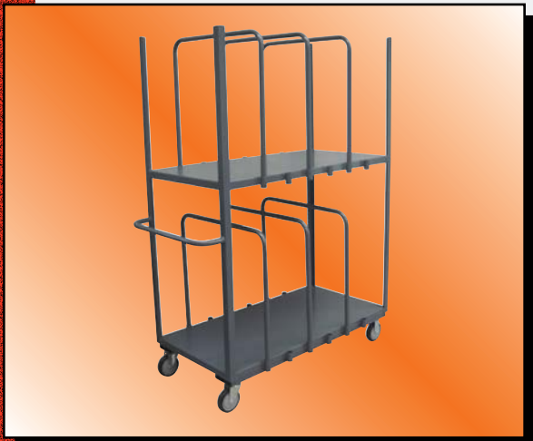
Model CP Shown

1,200 LB CAP.* (*800 lb. with T5 casters)