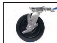
4 Position Swivel Lock and Brake Shown