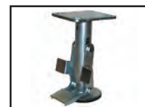
Optional Floor Lock