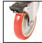
Available with Total Lock Casters replace -BRK with -TL