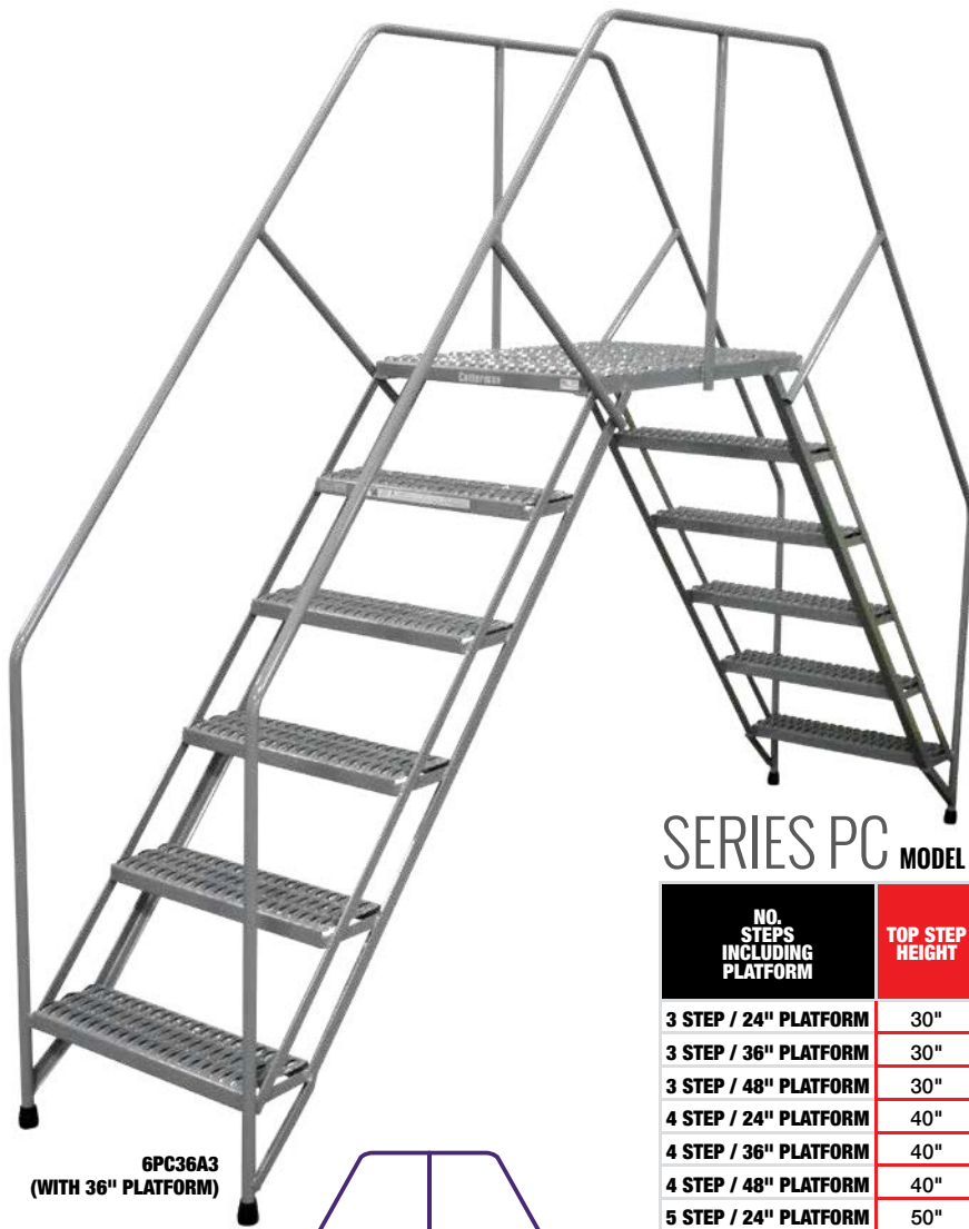
6PC36A3 (WITH 36" PLATFORM)