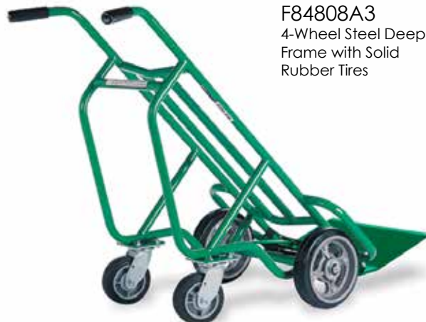
F84808A3 4-Wheel Steel Deep Frame with Solid Rubber Tires

2-Wheel Deep Frame Pallet Hand Trucks have a 6" longer frame and 19" skid rails to prevent truck from falling back on operator. Features 14-ga., 1 1/8" O.D. steel tubing with form-fitted joints and solid welds, or 1 5/16" spark-resistant aluminum tubing. Some models offer hand brakes for added safety. 1000-lb. load capacity.