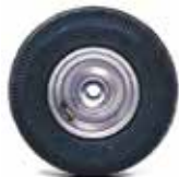
Pneumatic Tire 12 x 3½" Disassembles to replace tire and tube.