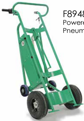
F89484 Powered Drum Truck Pneumatic