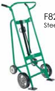
F82895A1 Steel Solid Rubber