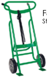
F81735A7 Steel Solid Rubber

Steel framed EZY-Rol™ Automatic Drum Trucks are the answer to safe and effective manual transport and handling of drum inventories. All drum trucks feature Valley Craft's exclusive EZY-Rol™ design and spring-loaded standard chime hook so the operator never has to touch the drum. Choice of 2-wheel or 4-wheel models. Shoes adjust to handle 30- and 55-gal. drums up to 1,000 lbs. Available with optional hand brakes for added safety. Replaceable wheels, shoes and axles available. Four additional chime hooks and three wheel options available.