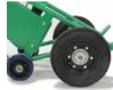
Pneumatic Tire 12 x 3½" Disassembles to replace tire and tube.