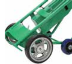
Solid Rubber Tire 10 x 2½" Standard tire on all drum trucks.