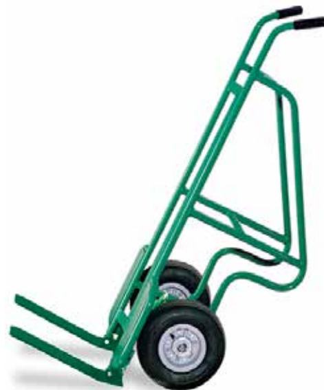
F84907A3 2-Wheel Steel Deep Frame with Pneumatic Tires