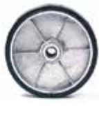
Molded-On Tire 10 x 2½" Brakes not available with this wheel.