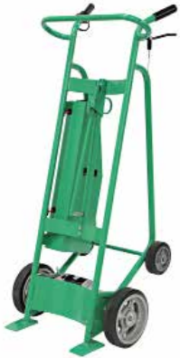
F89503 Powered Drum Truck Solid Rubber

Heavy Duty Powered Drum Trucks are designed for safe navigation of heavy loads in tight quarters and on inclines or uneven terrain. Perfect for places where traditional powered machines will not work due to space restriction. Features include a rugged 24V DC differential drive motor, full function forward and reverse travel with reverse audible warning, built-in 18 AH battery with charging/monitor system, and exclusive easy grip hand brake. Shoes adjust to handle 30- and 55-gal. drums up to 800 lbs. Includes our standard spring-loaded drum chime hook - four optional chime hooks available. Speed settings include 1.4MPH (walk) or 0.5MPH (crawl) speeds. Approved for use on a 5° incline.