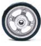
Solid Rubber Tire 10 x 2½" Standard tire on all drum trucks.