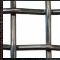
3/4" Sq. 10 Gauge *Actual Size