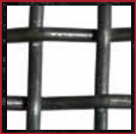
1/2" Sq. 12 Gauge *Actual Size

With a name like WireCrafters, it goes without saying that we offer a variety of welded and woven wire mesh at the industry's most competitive prices. Our standard mesh is a 2"x1" 10 Gauge. Optional meshes shown below.