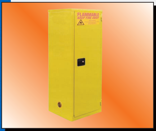
Model BA Shown