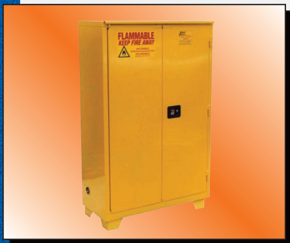
Model FF45 Shown