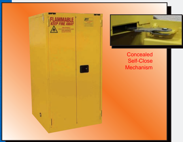
Concealed Self-Close Mechanism