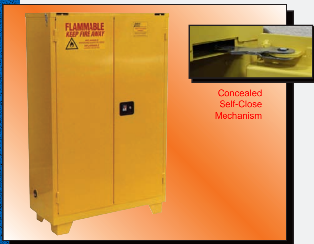
Model FS45 Shown