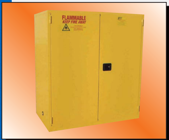
Model BM90 Shown