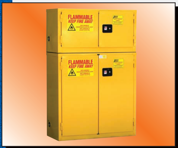
Model BY15 Shown Stacked on Model BM30

Models BY, BU – Store flammable items on counter or stacked on other cabinets