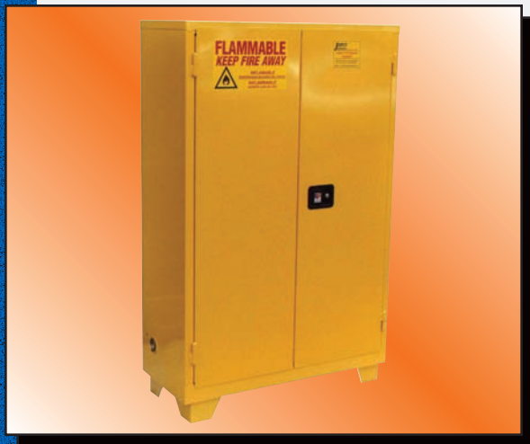
Model FM45 Shown