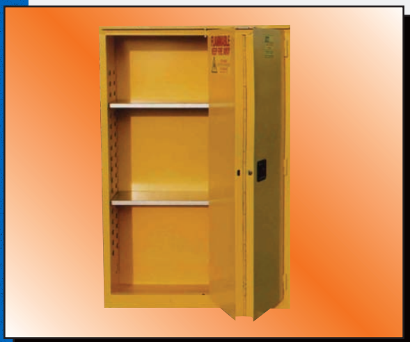
Model BF45 Shown