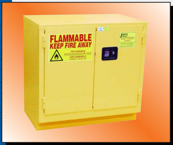
Model BT22 Shown

Models BT, BK – Store flammable items under counter, designed for laboratory use