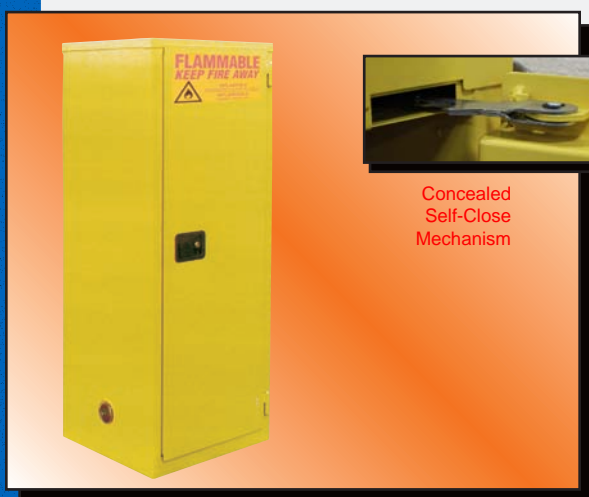
Concealed Self-Close Mechanism