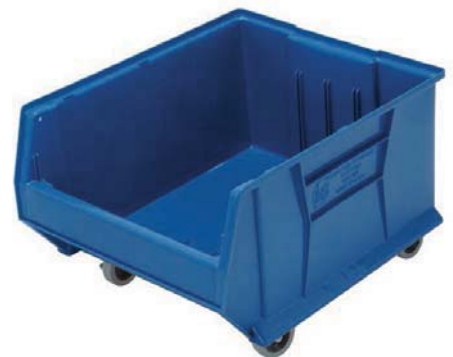
MOBILE HULK CONTAINER Ideal for transport of heavy and bulky parts. Bin comes with 4 swivel, 3" casters, all with brakes, allowing up to 250 lb. mobile load capacity