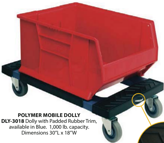
POLYMER MOBILE DOLLY DLY-3018 Dolly with Padded Rubber Trim, available in Blue. 1,000 lb. capacity. Dimensions 30" L x 18" W

ATTACHED PULL RING allows dolly to be pulled with ease