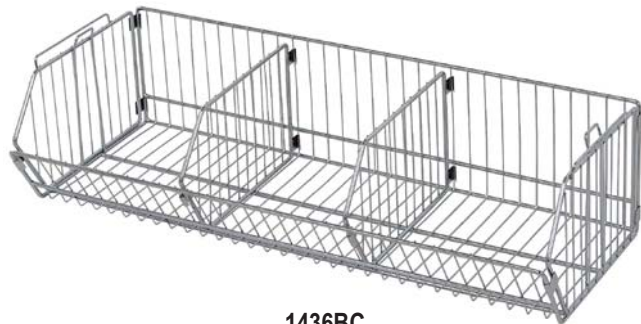
1436BC Shown with Dividers