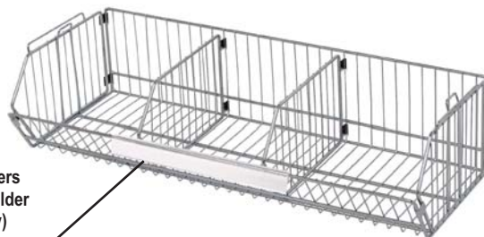
1436BC Shown with Dividers and Clear Label Holder (Sold separately)

Offer a variety of storage, display and mobile supply applications. Dividers can be used to separate product. Accessible front and a wide selection of sizes allow for all types of product to be used from storage to display. (Dividers sold separately) Finish: Chrome