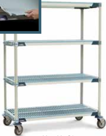
MetroMax® i 4-Tier with Open Grid or Solid Shelves