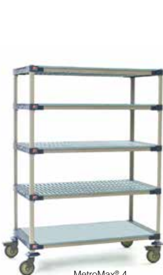
MetroMax® 4 5-Tier with Open Grid and Bottom Solid Shelf