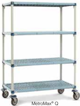
MetroMax® Q 4-Tier with Open Grid (5-Tier available)