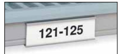
MetroMax® i Label Holder