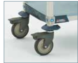
Solid bottom shelf and 5PCX/5PCBX casters