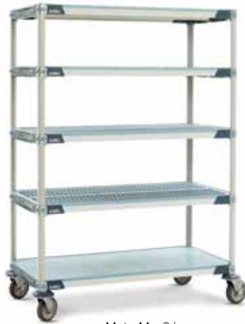
MetroMax® i 5-Tier with Solid Bottom Shelf