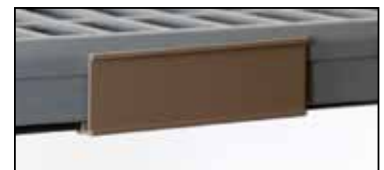
MetroMax® Q Label Holder