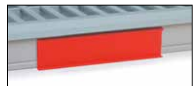
MetroMax® i Color Shelf Marker