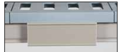
MetroMax® 4 Label Holder