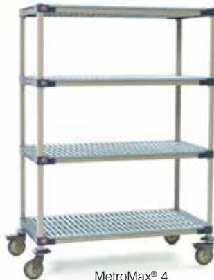
MetroMax® 4 4-Tier with Open Grid Shelves