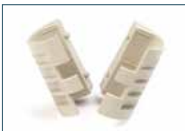
Tri-Lobal Adapters Included with handles.