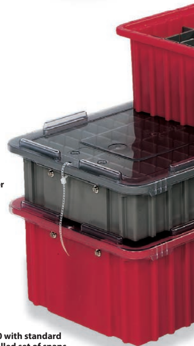
NDC2035 with security tie and CNDC2020 Cover