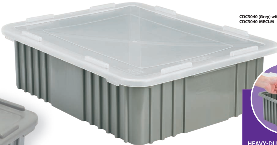
CDC3040 (Grey) with CDC3040-MECLM