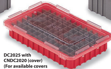
DC2025 with CNDC2020 (cover) (For available covers see pg. 13)

Increase part protection and prevent part migration with Divider Box Containers.