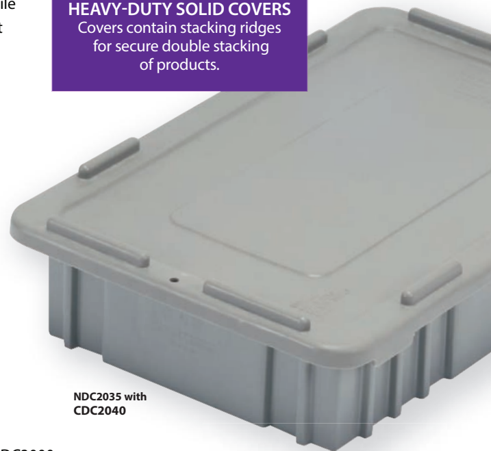
NDC2035 with CDC2040

Covers contain stacking ridges for secure double stacking of products.