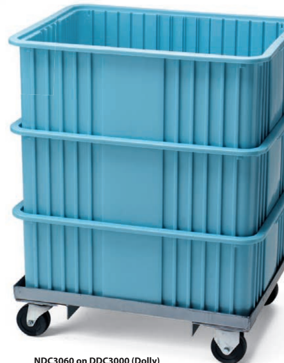
NDC3060 on DDC3000 (Dolly)