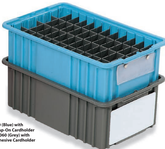
NDC2050 (Blue) with CH20 Snap-On Cardholder on NDC2060 (Grey) with CH10 Adhesive Cardholder