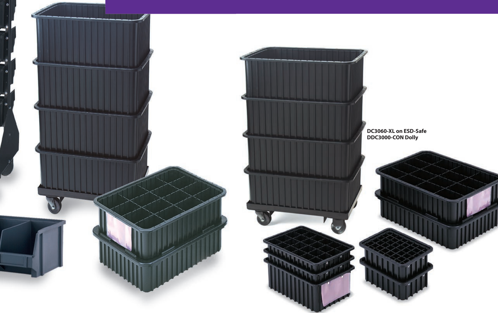
DC3060-XL on ESD-Safe DDC3000-CON Dolly

Protect valuable contents from static electricity.