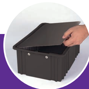
XL INSERT COVER

Move and protect your product with Dollies and Covers!