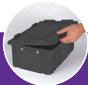
HEAVY DUTY XL SOLID COVER

# of Divider Slots on Short Side: 11 # of Divider Slots on Long Side: 15 Divider compartments are 1.125" square.