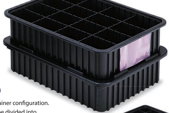
DC2025-XL (2) on DC2060-XL with CH10LS Cardholder