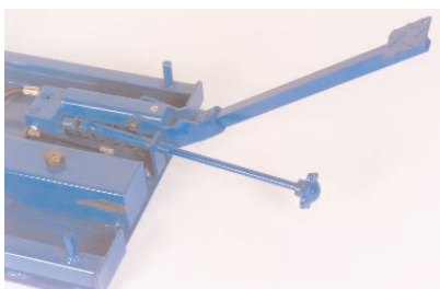
Removable & storable operator's foot pedal and lowering control on basic models.