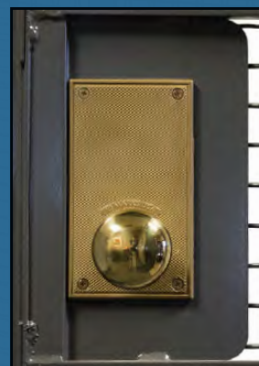
(SB-3) DOOR KNOB... typical size door knob for easy exit.