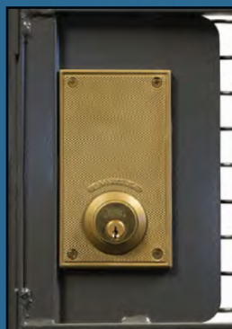
(SB-2) INTERIOR KEY... lock from both sides, keyed to match face side.

work with any of the fronts shown above.