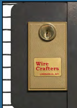
(SF-2) THUMB-TURN LATCH... latches only, does not lock.