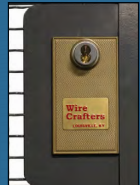
(SF-4) CYLINDER LESS INTERCHANGEABLE CORE... accepts small format core.