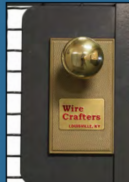
(SF-3) DOOR KNOB ENTRY... latches only, does not lock.