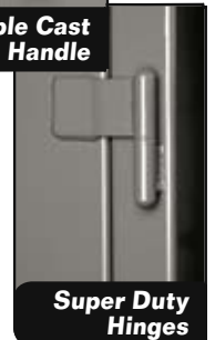
Super Duty Hinges

SXHDSC Series - Superior 12 gauge steel construction supports loads up to 2,000 lbs. per shelf, evenly distributed. Shelves adjust on 4" centers. Durable cast handle with padlock tab combined with locking rod assembly provides maximum security. Cabinet includes 6" legs. Constructed with super duty welded hinges. -D units include drawers. Options: Extra shelves.