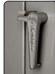
Durable Cast Handle