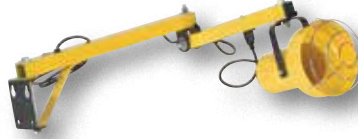
INCANDESCENT DOUBLE ARM model LL-40