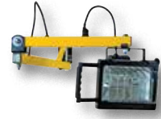
HALOGEN DOUBLE ARM model HLGN-40