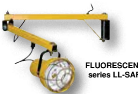
FLUORESCENT series LL-SAF