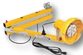
HIGH PRESSURE SODIUM model LLS-40