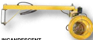
INCANDESCENT series LL-SAI