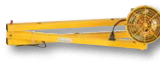
HIGH PRESSURE SODIUM model LLS-60