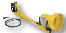
INCANDESCENT SINGLE ARM model LL-24

High Pressure Sodium Lights, series LLS and AALLS, offer much higher lumens/watt output and a very long lamp life. Its illumination color rendition (yellowish) is not as desirable as an incandescent. They typically require several minutes to fully illuminate, and even longer if in a cold environment. Low operating cost.