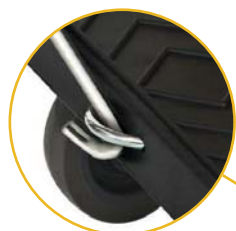
ATTACHED PULL RING allows dolly to be pulled with ease