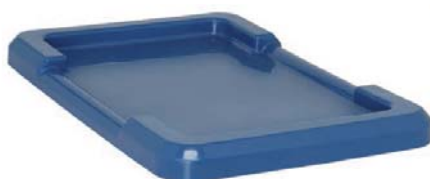
LID2516-8 Optional lid keeps stored items dust free. Tubs can still stack or cross stack with lids in place.