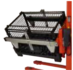
Rotator with adjustable box holders with clamps and two sets of side support plates.