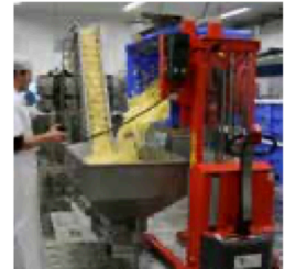
The Rotator is here used in the food industry.