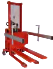
Non-adjustable box holders: Depending on the height/weight of the load, one or two sets of box holders (with/without clamps) can be fitted (optional extras).

Box holders with clamps are recommended when tilting more than 60°.