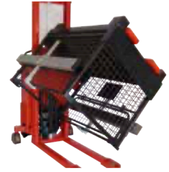
The Rotator can turn a box 180° to empty it fully, when equipped with box holders with clamps.