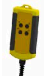
Lifting, lowering and rotation are controlled by cable remote (as standard). Wireless remote control for lifting, lowering and rotation is available as optional extras.