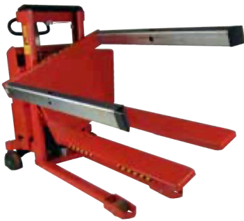
Rotator with adjustable box holders can easily be adjusted to boxes with widths from 31.5" to 48".