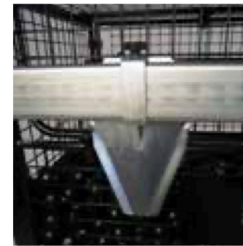
Adjustable box holders: Depending on the stability and type of the box, side support plates can be chosen as optional extra.