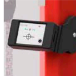
Touch screen. Log function. Possible to program e.g. several stops, turning angle, speed, rotation. Shows error messages.