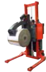
With Rotator Reel Clamp heavy reels can be transported, lifted and rotated 90° to each side.