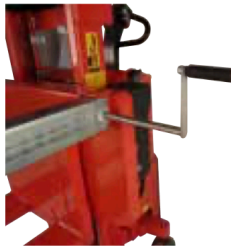
Adjustable box holders: The width is adjusted by a handle, so that the width fits the requested box width (between 31.5" and 48").