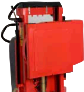
Multi-purpose carriage, which can be adjusted to fit specific customer items, e.g. tools.