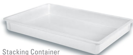
Stacking Container Model No. 870008 White