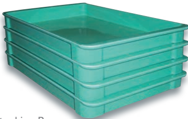
Stacking Boxes Model No. 804008 Green