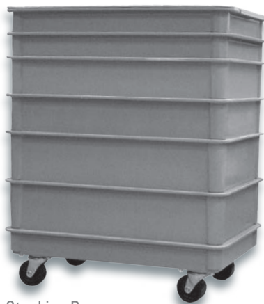
Stacking Boxes Model No. 887008 Lid, 870008, 875008, 880008 and 870148 Dolly Gray