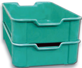
Stacking Boxes Model No. 819008 Green