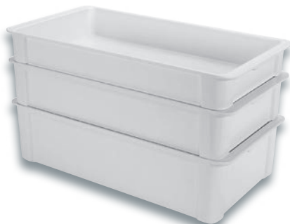
Stacking Boxes Model No. 808208, 808308 and 808408 White