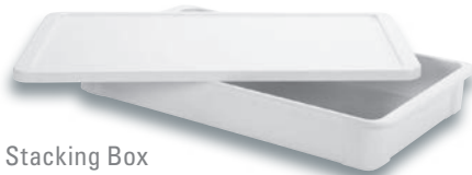
Stacking Box Model No. 808208 with Model No. 808218 Lid White