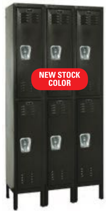
Double Tier, 3 wide, 6 openings Black