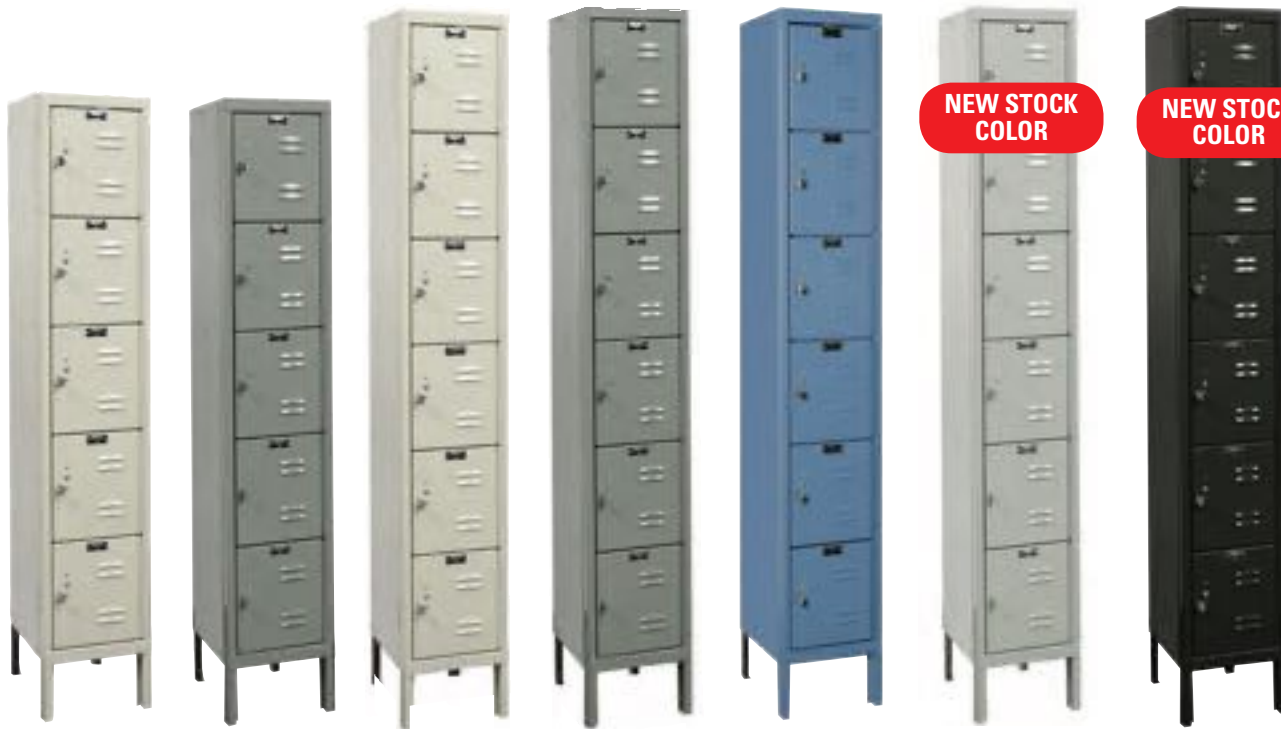
Five Tier, 1 wide, 5 openings Tan