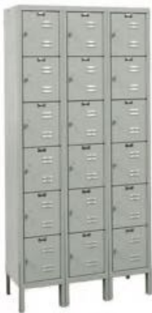
Six Tier, 3 wide, 18 openings Light Gray