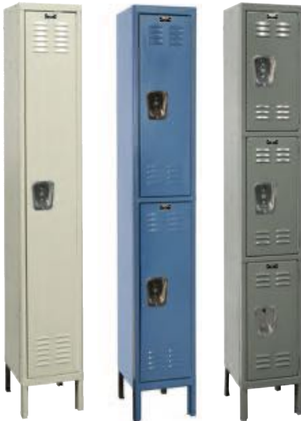
Single Tier, 1 wide, 1 opening Tan