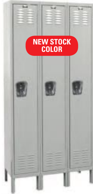
Single Tier, 3 wide, 3 openings Light Gray