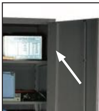
18-gauge full-height door stiffener provides maximum rigidity to both doors