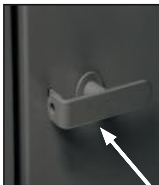
Heavy-Duty 3/16" thick steel handle with padlock hasp.