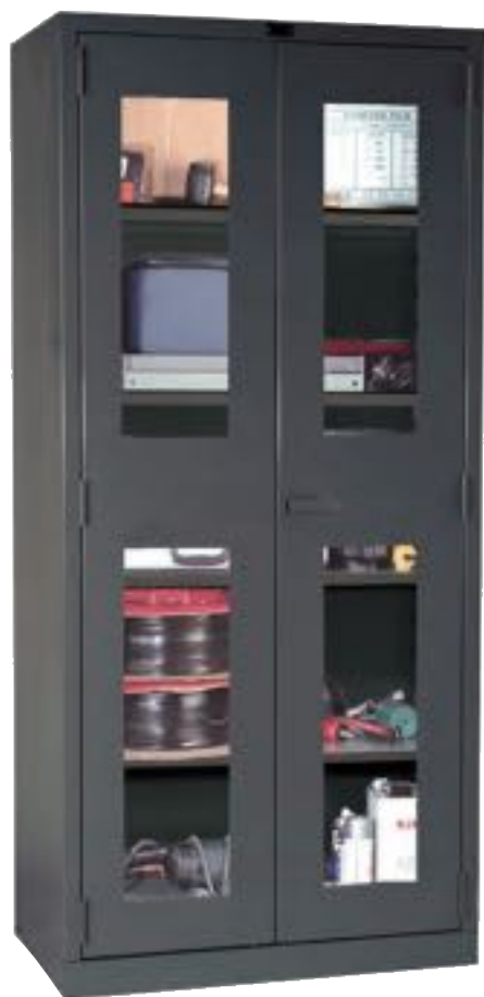
Safety-View Door Cabinet