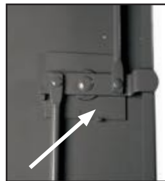
1/8" thick latch and 3/8" diameter lock rods insure maximum security