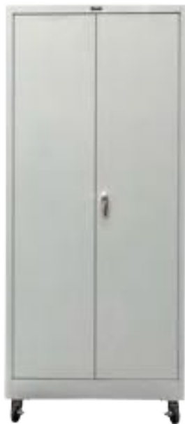
MOBILE STORAGE SOLID DOORS