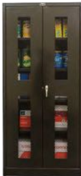
STATIONARY STORAGE VENTILATED DOORS