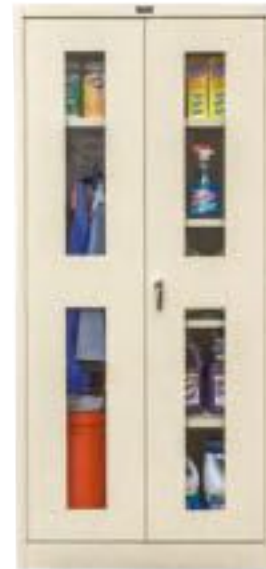
STATIONARY COMBINATION SAFETY-VIEW DOORS