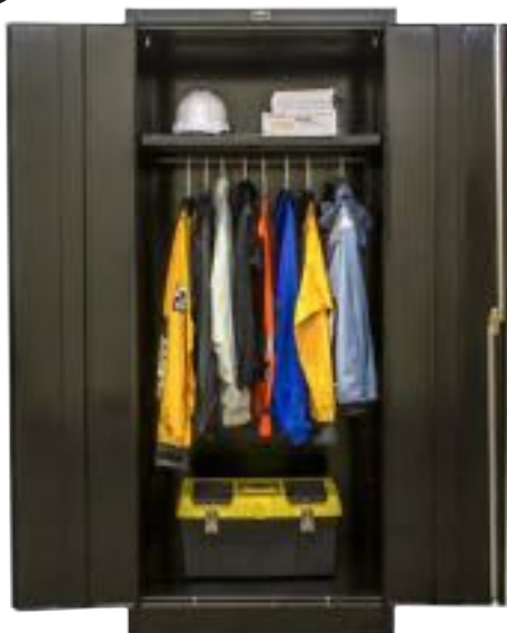
STATIONARY WARDROBE SOLID DOORS