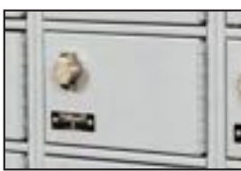
PREPARED FOR PADLOCK