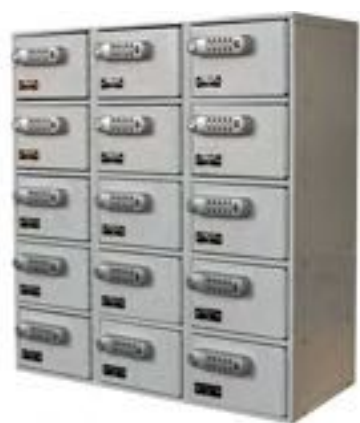
Shown With Digitech Electronic Access Lock

EASILY STORE AND PROTECT PERSONAL BELONGINGS.