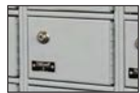
KEY CAM LOCK