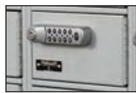
DIGITECH ELECTRONIC ACCESS LOCK