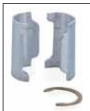
Aluminum Split Sleeves

Bag of four aluminum sleeves with C-rings.