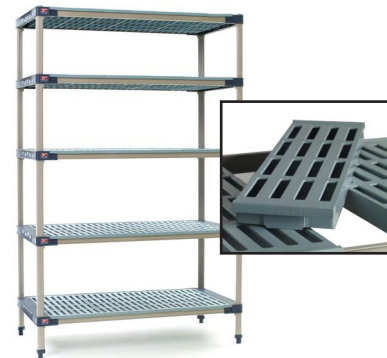
Five Tier Starter Unit