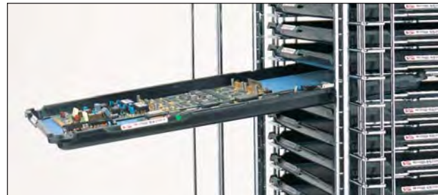
SmartTray™ engages with wire cart design to provide optimum ergonomic access.