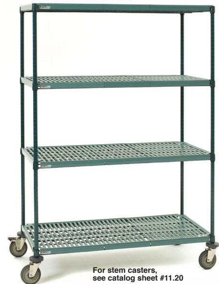
For stem casters, see catalog sheet #11.20